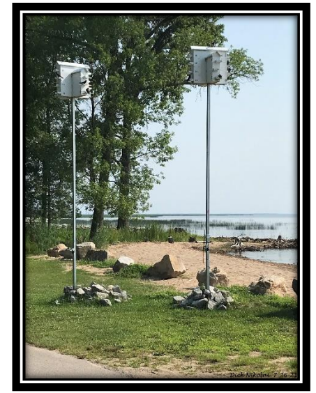
Figures D, E & F from left to right: In 2019 at City Park the shoreline edge was eaten away where one house went down in mid-May while the second house & pole was ripped and dangerously threatened. Martins had already arrived and we chose to place the house beyond the large rocks as seen in the third photo on the left. In fall 2019, the second house on Figure E was moved to the location seen in Figure F to the right of where both exist at the present. Fortunately, only one adult was lost even though some eggs were destroyed.

Nesting season during 2020 provided stable high-water levels at City Park carrying through 2023 was a gift when shoreline levels started to go down. In 2024 water levels have come down more with the hope for 2025 to have low levels not impacting any housing. New housing to be placed is housing donated by Troyer Gourds (Figure G) with its current demonstration site for Martin Fest 2025 at City Park then its permanent placement at City Dock thereafter.