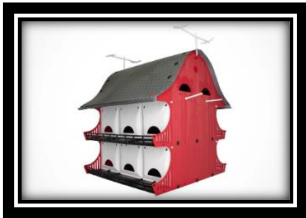
Figure A: S & K ( 16 Family Purple Martin Barn ) made of plastic comprising of three colors with green for trim and the roof of the house, ends were of red, and door openings were white. Two cavities were located on each end (6" X 9") with six cavities on the front and back (6" X 6") totaling 16. For maintenance, the roof needed to be pried open with the fronts of each story of three cavities operating as a single door.

Oconto Purple Martin Colonies comprise of several sites across the city proper totaling several types of housing comprised of two Lonestar Alamo houses (Aluminum) at City Park on two poles and at City Dock one pole with two reconstructed Trio Wade houses (Aluminum) with four plastic gourds comprising of three Super Gourds and one Troyer Vertical gourd hanging below on a pole through the 2024 nesting season. The City Park site was started in 2015 while Oconto was one of the many of Wisconsin's Bird Cities started in ( 2012 ). The first purple martin housing placement at City Park was comprised of a single unit Trio Wade (Nature House) now Erva which had ten pairs (total cavities 12 of 6" X 6" X 6") of martins in the first season. In 2016, two houses called "16 Family Purple Martin Barn" (Figure A) from S & K Manufacturing Inc were placed in the spring by the Oconto Park's Department, which were quickly occupied by 14 pairs of purple martins that laid 54 eggs. During 2017, the S & K houses were replaced with a grant from the " Songbird Essentials Buy One-Get One Grant Program " when two Lonestar Alamo houses were erected ( Figure B ). The 2017 season at City Park yielded ten pairs that laid 52 eggs, hatched 43 young, and fledged 39 young.