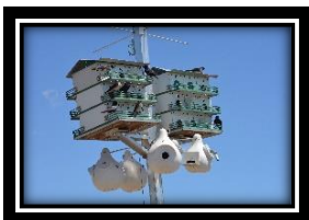
Figure C: Trio Wade (left) housing placed in 2015 at City Park & in 2018 at City Dock with gourds.