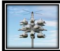
Figure G: Troyer Gourd Rack (Ultimate-Deluxe K-18 TVGC & Pole) with ground stake donated in 2025.

In 2019, Oconto City Park had seven pairs fledged 33 young and at City Dock another 13 pairs fledging 56 young. High water at City Park began rising during 2018 through 2021 affecting the housing stability. Note Figure D showing the unstable soil and wave actions impacting the base along the high-water line.